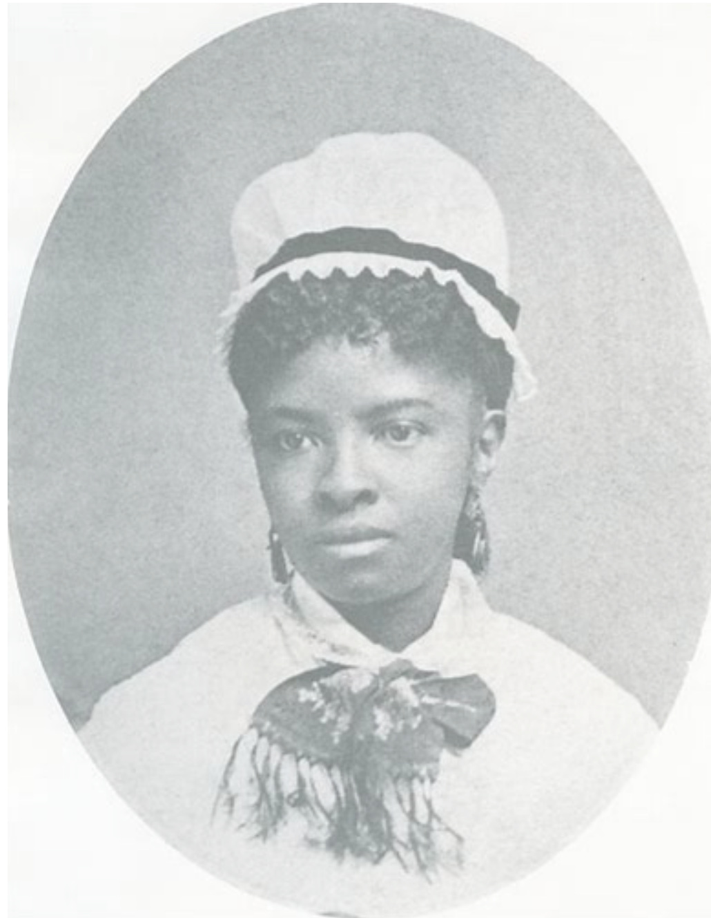
Mary Eliza Mahoney